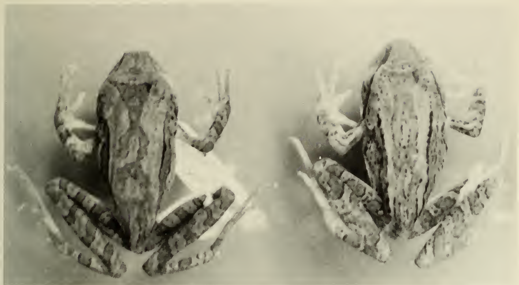
Fig. 1. Eleutherodactylus fraudator , left: holotype, USNM 257847; right: paratype, USNM 257846.

with darker brown interorbital triangle continuing posteriorly as a pair of stripes vaguely recalling scapular and sacral chevrons (Fig. 1); lateral margin of dorsolateral fold very dark brown delineating a brown flank band bordered ventrally by paler coloration; irregular dark brown marks forming broken stripe beginning above forelimbs and extending ventrally on anterior \frac{1}{4} of flank; canthal stripe broad, dark brown, extending posteriorly above and below eye to join supratympanic stripe; supratympanic stripe expanded ventrally to form blotch, edged ventrally by cream line; tympanum dark, continuous with supratympanic stripe, annulus only slightly lighter; brown stripe on margin of upper lip; limbs irregularly barred (bars wider or narrower than interspaces, darkest marginally); top of thigh barred; posterior surface of thigh essentially dark brown with some traces of lighter mottling; groin pigmentless except in glandular area that is ochre in one specimen; ventral surfaces cream dusted with brown, heaviest on throat and chest.